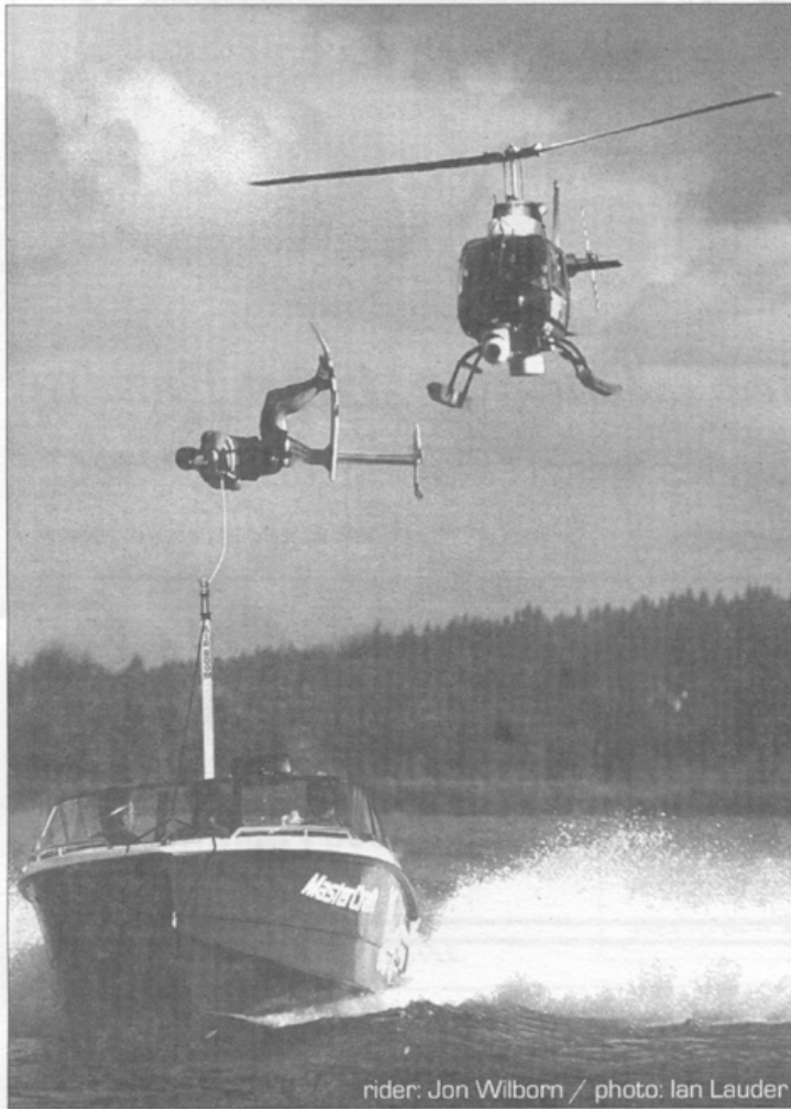
rider: Jon Wilborn